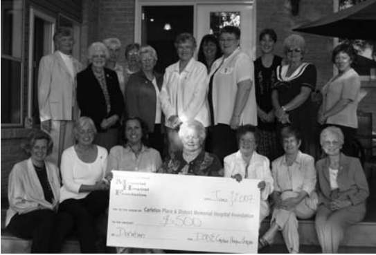
Members of the IODE Captain Hooper Chapter with a cheque to represent their $500 donation to the CPDMH Foundation.