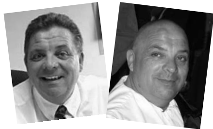
Mayor Paul Dulmage